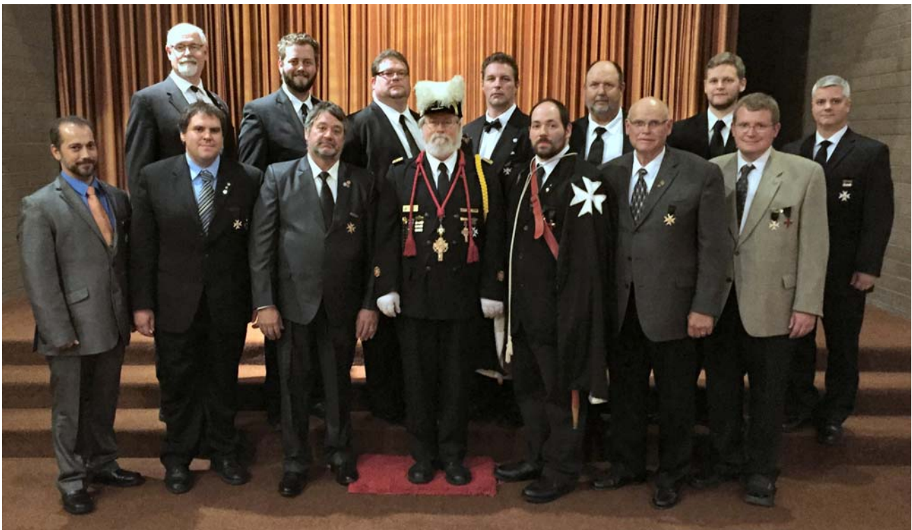
The Illustrious Order of the Red Cross and Order of Malta Class of 2016.

Ivanhoe Commandery's Annual Christmas Observance and Christmas Party will be held on Sunday, December 4, 2016. Please reserve the date and watch for details. We hope you can join us as we celebrate the birth of our Blessed Savior.